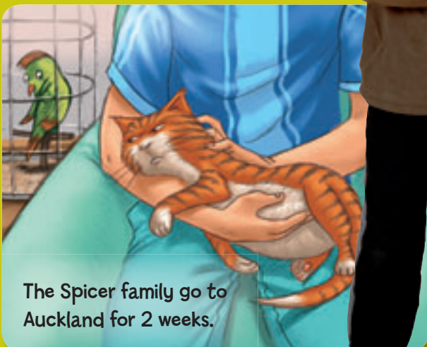
The Spicer family go to Auckland for 2 weeks.