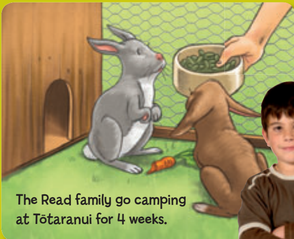
The Read family go camping at Tōtaranui for 4 weeks.

I charge $2 per neighbour per day to look after their cats, hens, budgies, goldfish, and rabbits. The owners supply all the food, and I'm allowed to keep the eggs that the Karims' hens lay. I always spend some extra time with the cats and the rabbits.