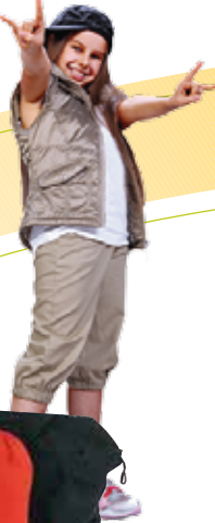
Grandma Turi Rotorua